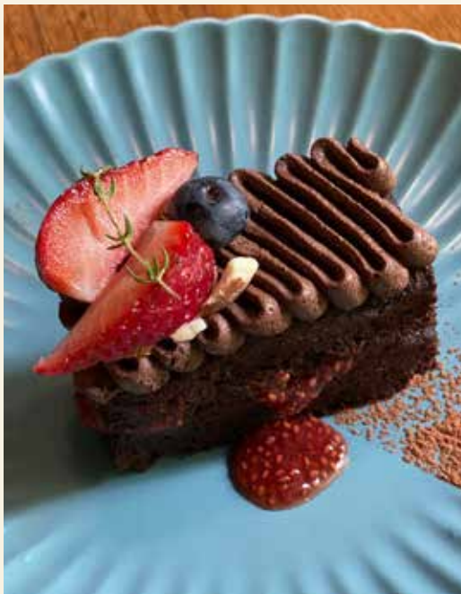
Chocolate Cake with Strawberry Chia Jam