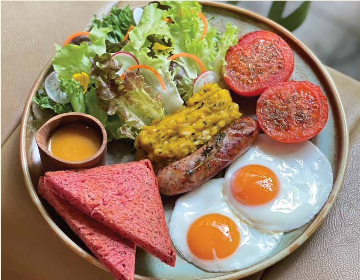
All Day Everyday 350.-

Your all-day go-to: clean-label pork sausage, organic sunny-side-up eggs, and roasted veggies with our signature mashed pumpkin and vibrant beetroot-perilla seed bread. Balanced with fresh organic greens and your choice of dressing—high in protein, antioxidants, and healthy fats to fuel your day, any time.