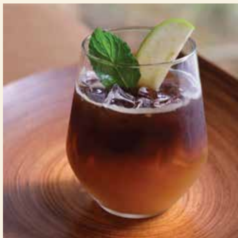
Dark Apple Espresso with fresh cold-pressed apple juice 160.-