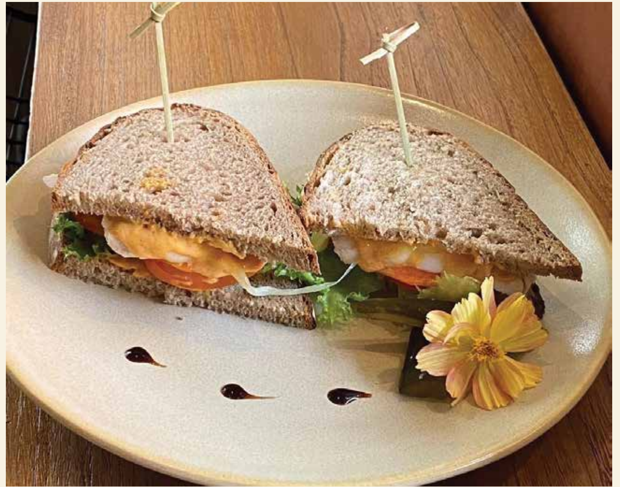
Baked Chicken Parmigiana Sandwich 350.-

Warm sourdough gently holding tender sous-vide chicken, artisan mozzarella, and crisp organic vegetables. Flavors come together with a touch of spice and tang—from our house sauces and lovingly pickled cucumbers.