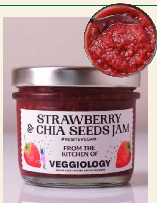
Strawberry Chia Jam