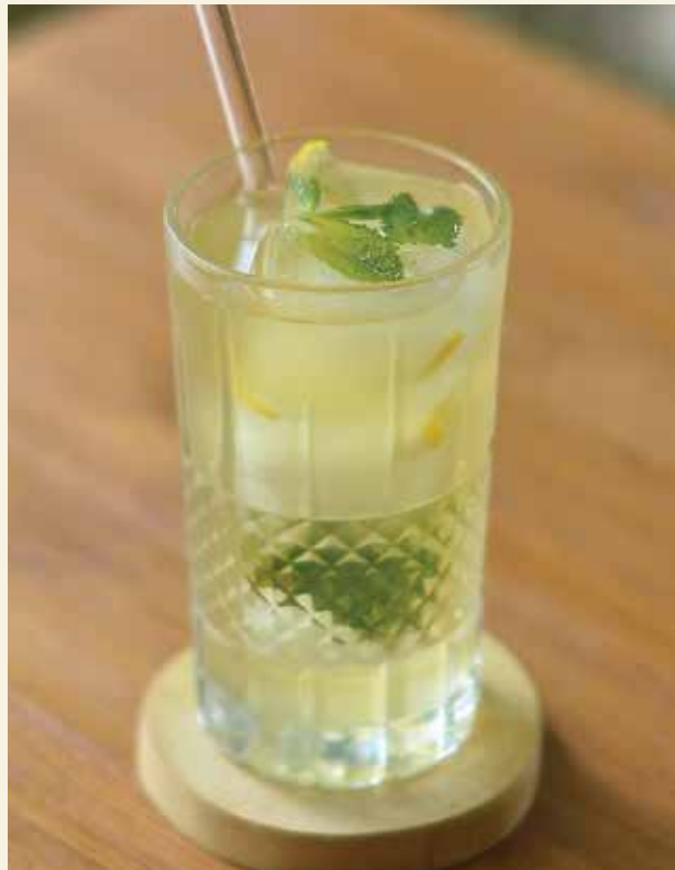
Yuzu Honey Soda

Housemade Organic Lavender -Honey Syrup Organic Honey Organic Butterfly Pea Soda Organic Lime