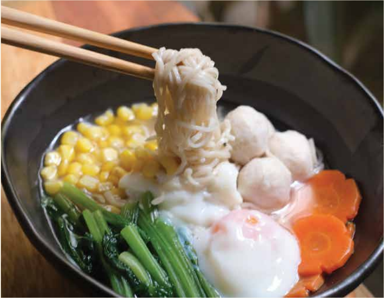
Egg Noodles with Chicken Balls & Onsen Egg 160.-

Made with clean egg noodles—no additives, just real eggs and flour. Served with organic vegetables and a flavorful house-made broth.