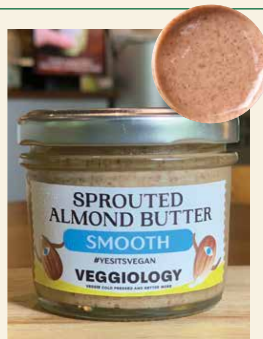
Sprouted Almond Butter “SMOOTH”