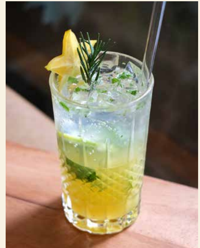
Starfruit Virgin Mojito

Cold-Pressed Red Apple Cold-Pressed Granny Smith Apple Cold-Pressed Honey Pear