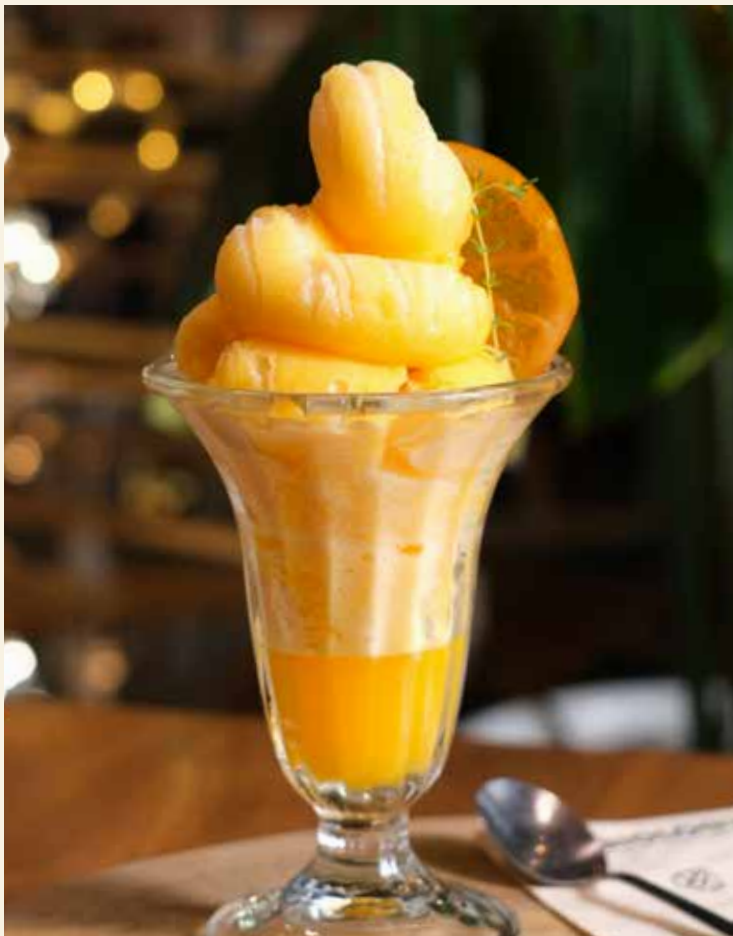
Pure Double Orange Slushie

Topped : Fresh Romaine Lettuce, Organic Banana Organic Carrot, Strawberry, Blueberry Honey , Chia Seeds Jelly