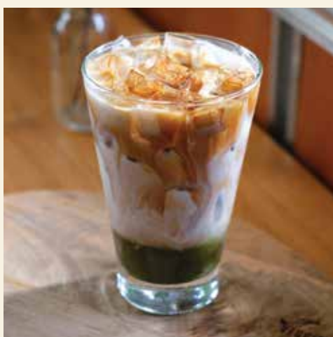
Iced Mugwort Latte with organic milk 160.-