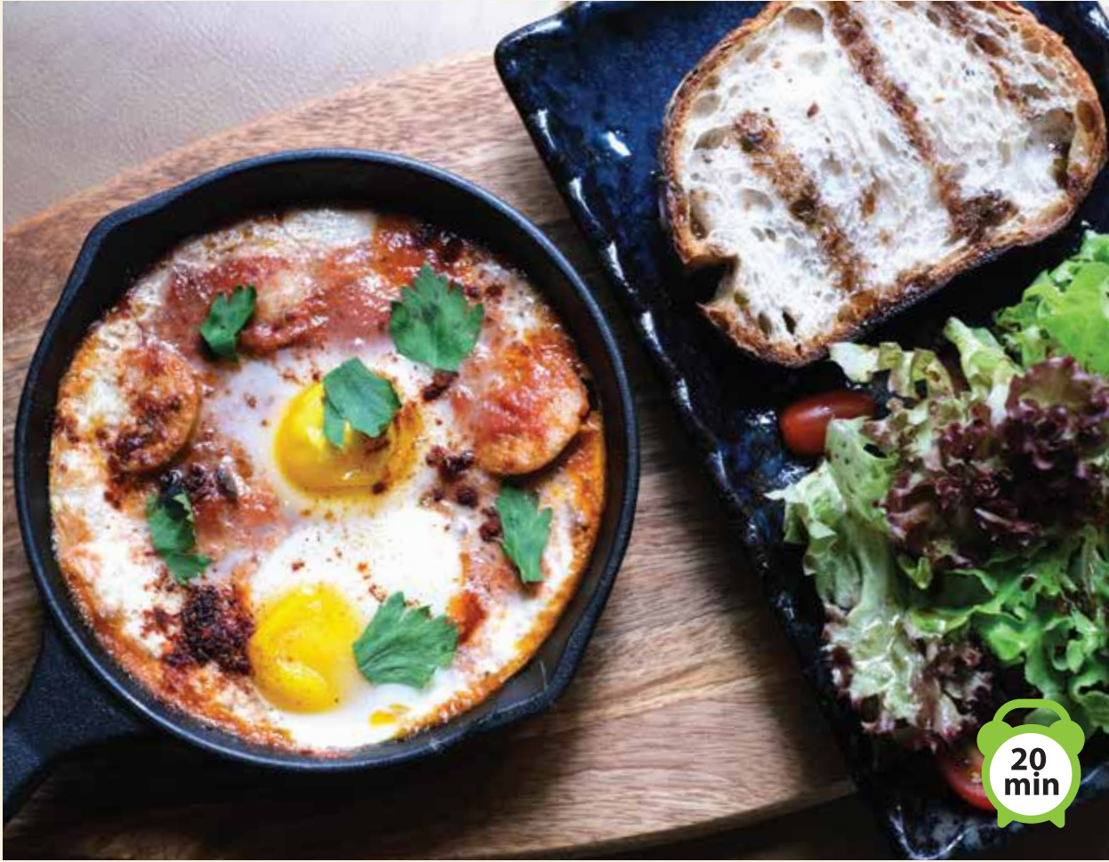
Sriracha Shakshuka Baked Eggs with Homemade Sausage 380.-

Sriracha Shakshuka Baked Eggs with Homemade Sausage. A hearty skillet of baked organic eggs in spicy tomato sauce, paired with natural pork sausage, grilled eggplant, and our sourdough toast. Just the right heat, just the right comfort. This dish delivers high-quality protein, lycopene from cooked tomatoes, and gut-friendly fiber—great for sustained energy and immune support.