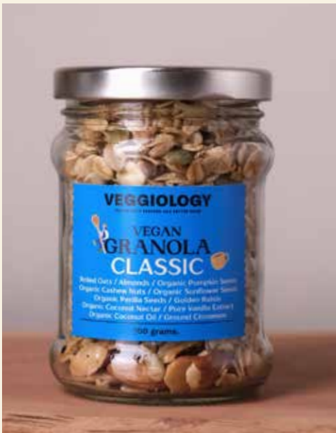
Housemade Granola “Classic”