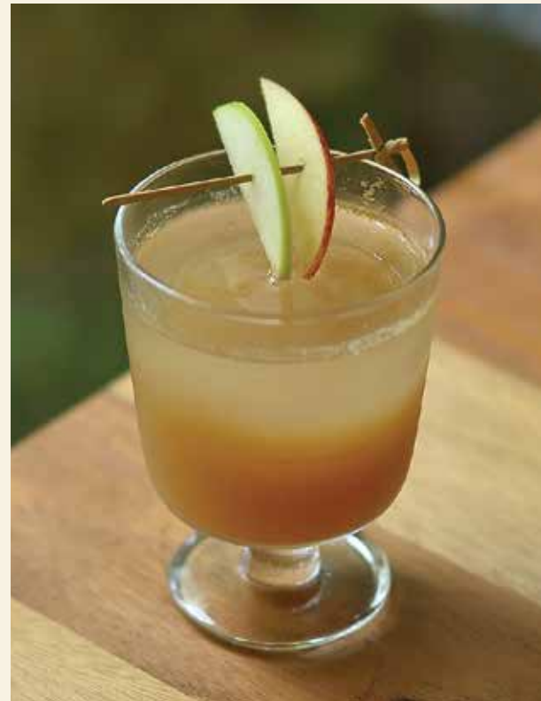
Apple Apple Pear

Kochi Yuzu is renowned for its bright aroma, delicate acidity, and high essential oil content — a result of being cultivated in the pure mountain air and mineral-rich soil of southern Japan.