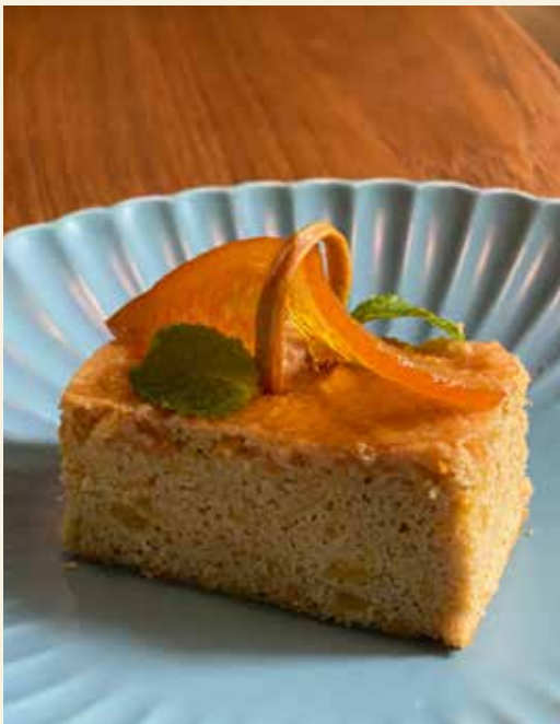
Flourless Whole Orange Almond Cake