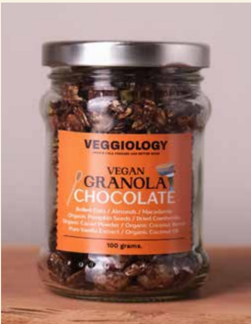
Housemade Granola “Chocolate”