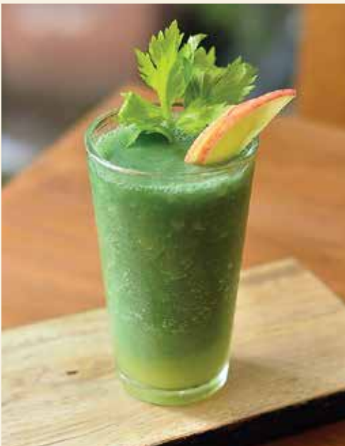
Celery Melody 185.-

Strawberry Organic Beetroot Organic Pineapple Organic Watercress Organic Lime Organic Yogurt Housemade -Sprouted Almond Milk