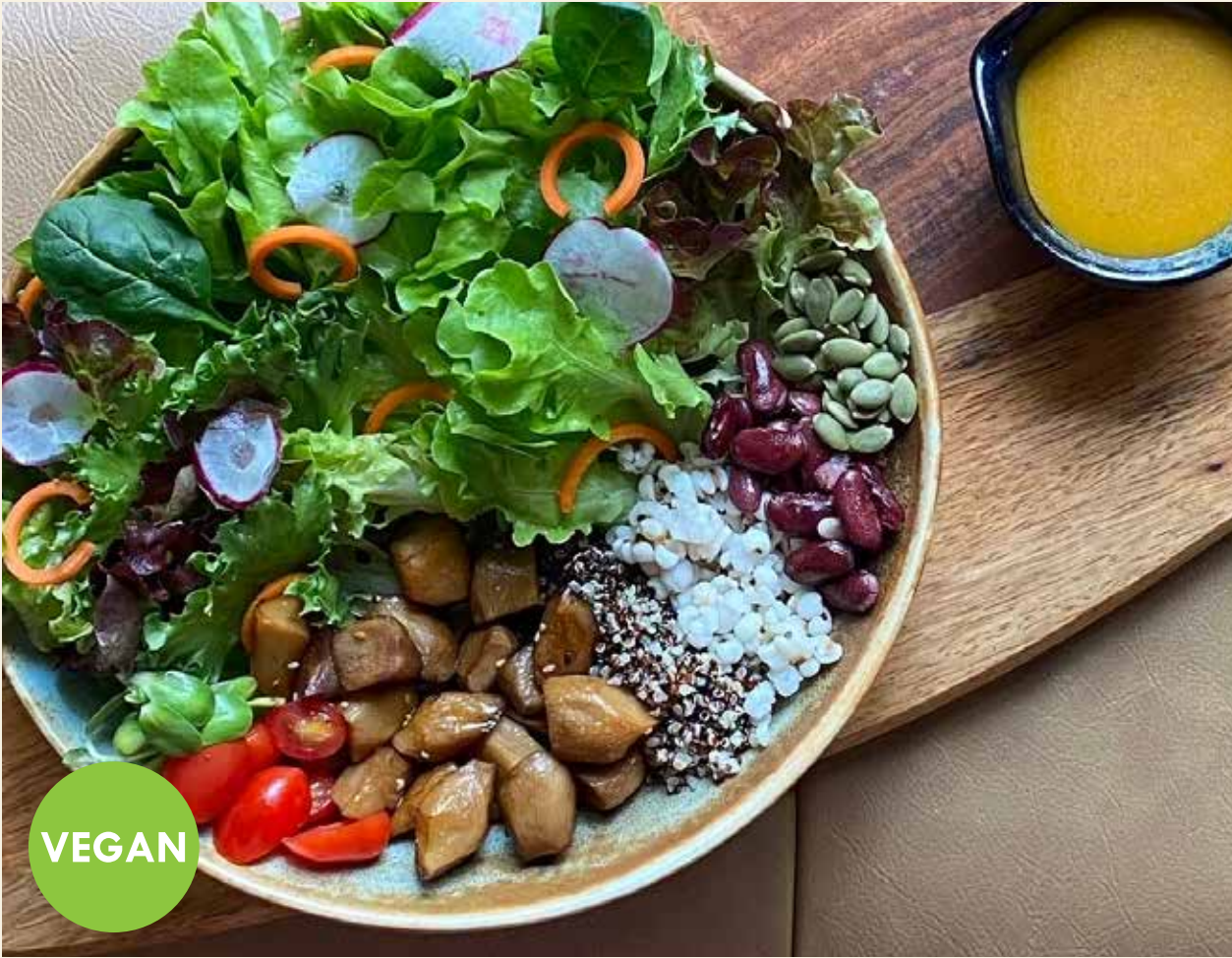
Sautéed Sesame Mushroom Multigrains Forest Salad 290.-

Sautéed organic king oyster mushrooms glazed in toasted sesame oil rest gently on a bed of vibrant greens, quinoa, pearl barley, red kidney beans, and pumpkin seeds. This serene, plant-powered bowl offers more than just flavor—it’s rich in fiber, antioxidants, and plant-based protein, designed to nourish your body while calming your mind. It’s a quiet kind of nourishment—deep, clean, and intentional.