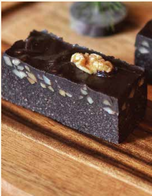
Unbaked Brownies with Chocolate Ganache