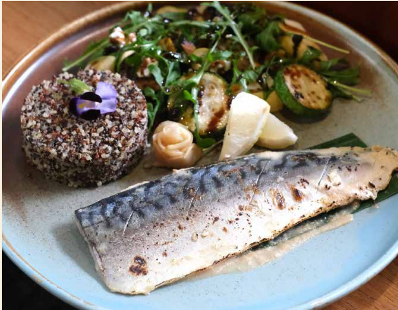
Sous-Vide Japanese Miso Mackerel with Quinoa and Grilled Vegetable Salad 450.-

A nourishing plate of wild-caught mackerel, slow-cooked sous-vide in aged miso. The fillet is completely boneless and incredibly tender, melting into each bite with ease.