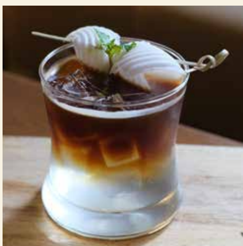
CoCo-Cano Espresso with Organic fresh coconut water 160.-