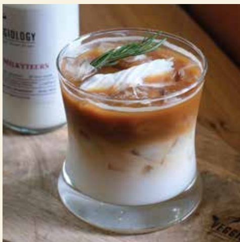
Caffe Milkyteers Espresso with our The 3 Milkyteers 180.-