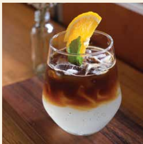
Espresso Yuzu Tonic 140.-