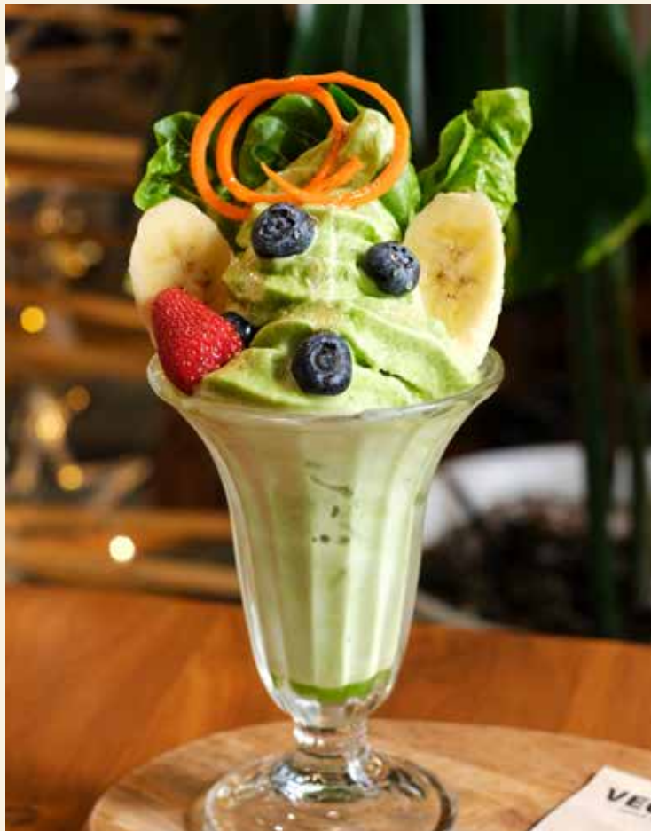
Organic Cold-Pressed Veggie Slushie

No Added Sugar. No Water. No Thickeners Just fruit and vegetable juice - That's it.