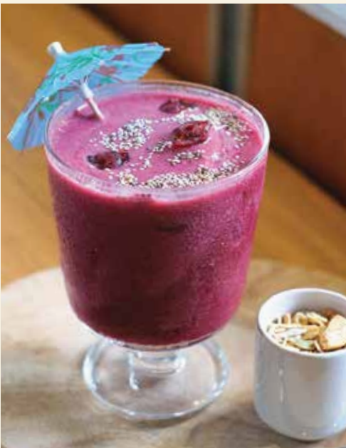
Rhapsody Red 195.-

Organic Cacao Organic Watercress Blueberry Dates Organic Banana Organic Golden Flaxseed Housemade -Sprouted Almond Milk