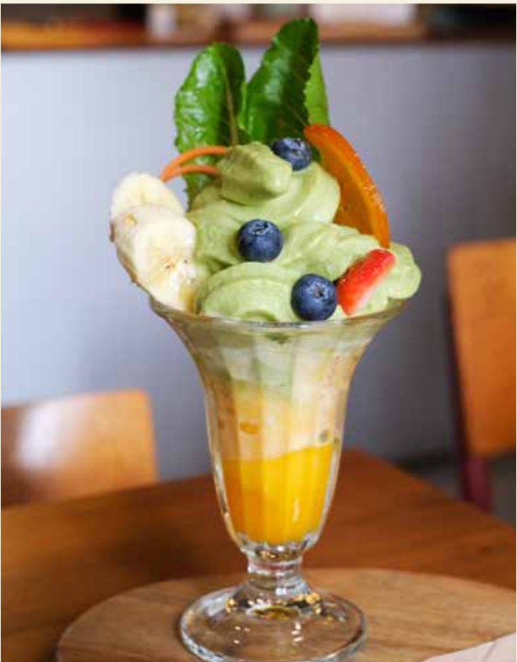
Organic Cold-Pressed Veggie Slushie Mix with Pure Double Orange Slushie

* Citrus variety may vary based on seasonal availability.