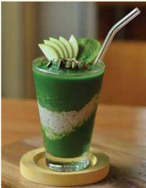
Silent Brave 195.-

Organic Spinach Organic Romaine Lettuce Organic Celery Granny Smith Apple Honey Pear Organic Banana Organic Lime Organic Spirulina Organic Chia Seed Oil Organic Chia Seed Pudding with Housemade Sprouted Almond Milk