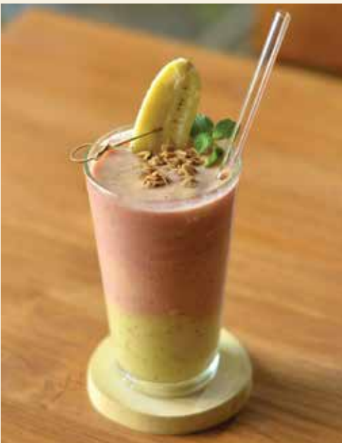
At Ease 195.-

Organic Spinach Organic Romaine Lettuce Organic Celery Granny Smith Apple Honey Pear Organic Banana Organic Lime Organic Spirulina Organic Chia Seed Oil Organic Chia Seed Pudding with Housemade Sprouted Almond Milk