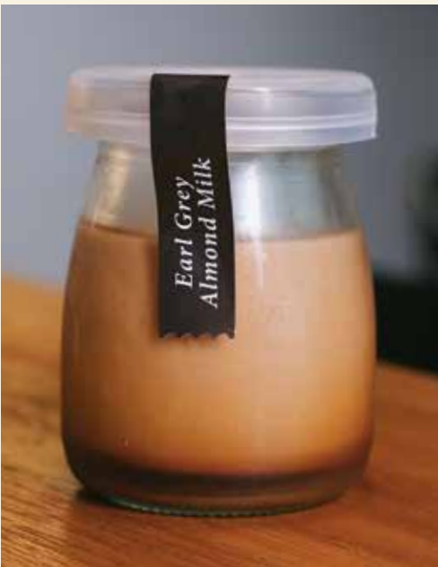
Vegan Caramel Custard Earl Grey - Almond Milk