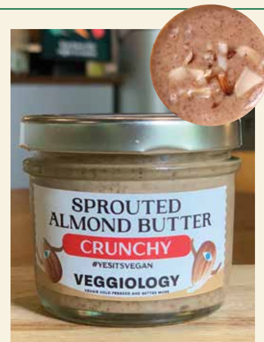
Sprouted Almond Butter “CRUNCHY”

Almond butter made only from sprouted almonds — for better digestion, richer nutrients, and a naturally creamy taste. No Sugar. No Oil. No Compromise.