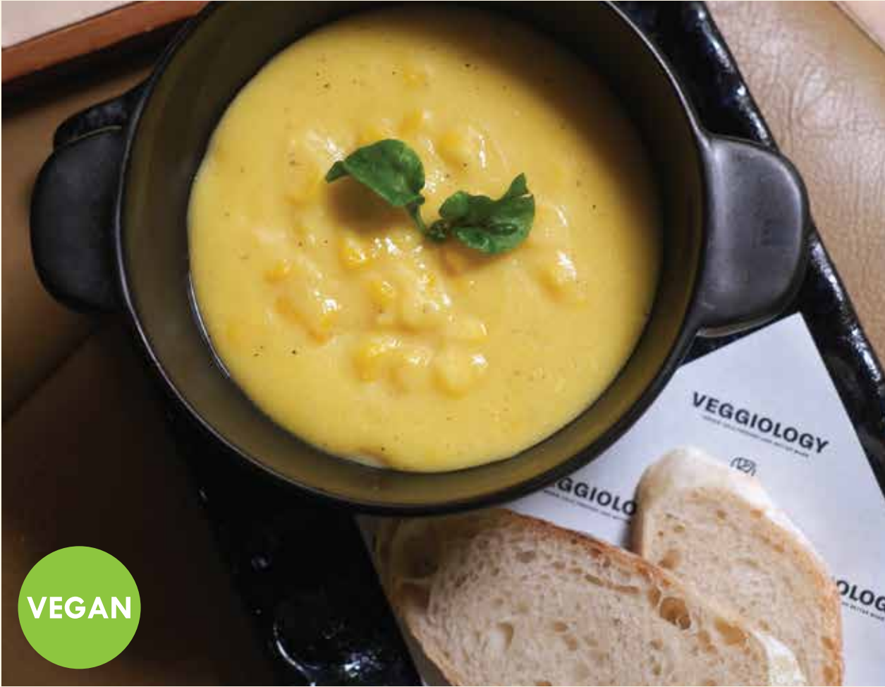
Organic Pure Corn Soup 220.-

Made from 100% organic sweet corn—no cream, no milk, and barely any water.