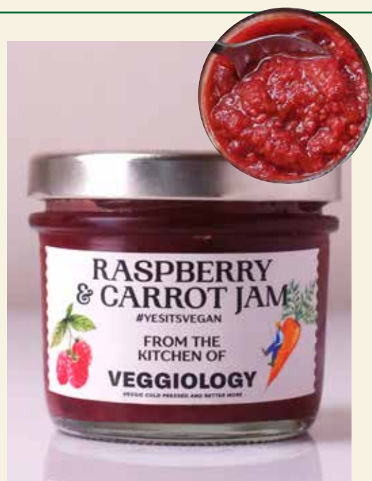
Raspberry & Carrot Jam