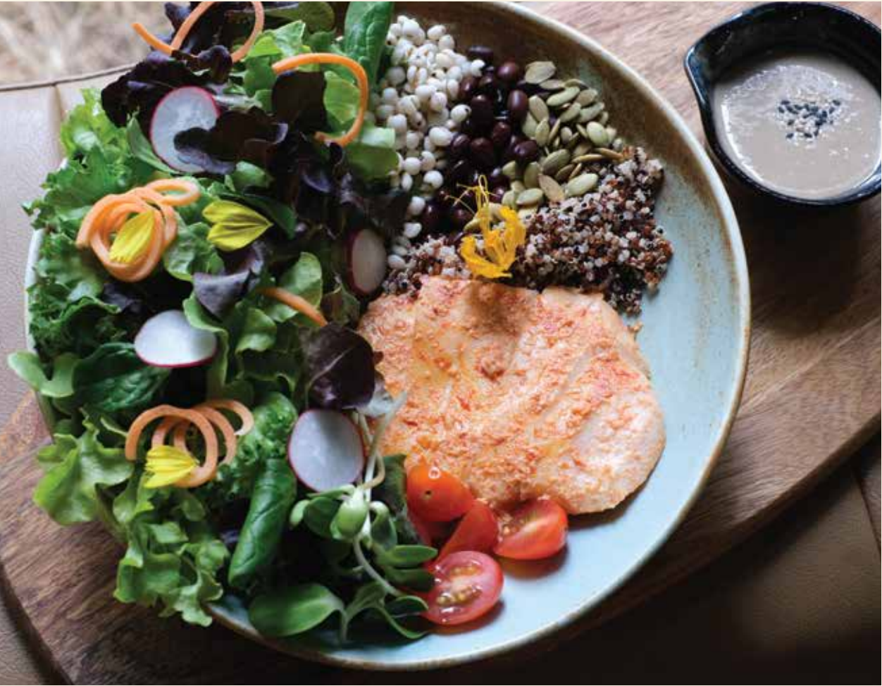
Sous-Vide Spicy Chicken Multigrains Forest Salad 350.-

Your Choices of Our Dressing (All Vegan) - Yuzu & Carrot (Carrot, Yuzu, Olive Oil, Onion, Soy Sauce, Vinegar, Sugar, Salt) - Miso & Sesame (Sesame Seeds, Sesame Oil, Miso, Tahini, Maple Syrup, Lime)