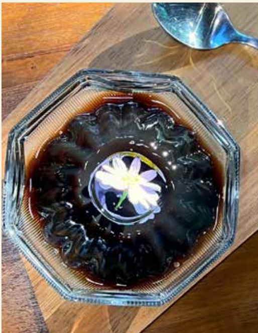
Organic Grass Jelly Pudding