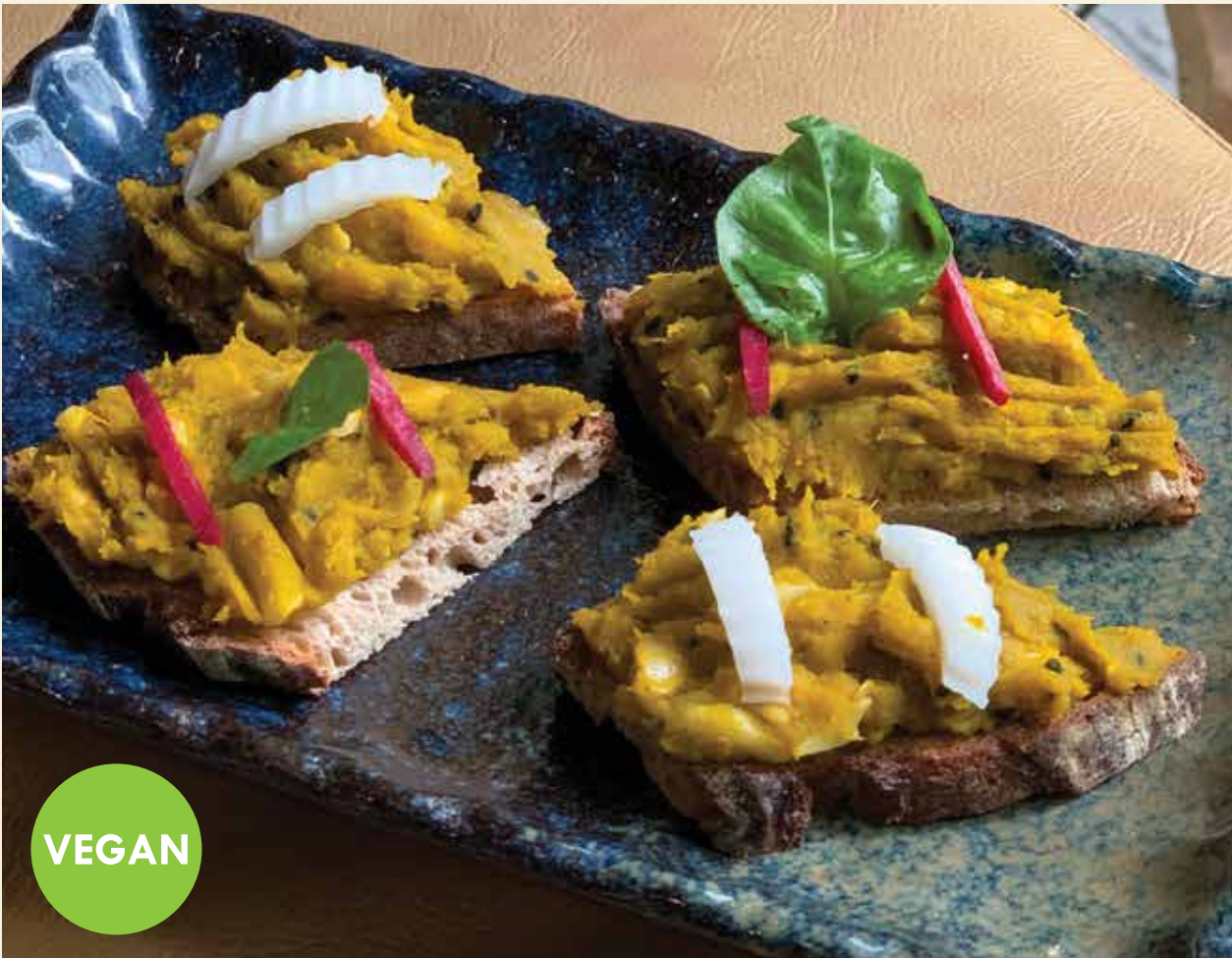
Mashed Pumpkin with Roasted Coconut on Homemade Sourdough Bread 170.-

Creamy mashed pumpkin with roasted coconut, spiced gently with lemongrass, garlic, and herbs—spread over our crusty sourdough toast. A naturally sweet and savory vegan toast rich in fiber, beta-carotene, and healthy fats from coconut and nuts.