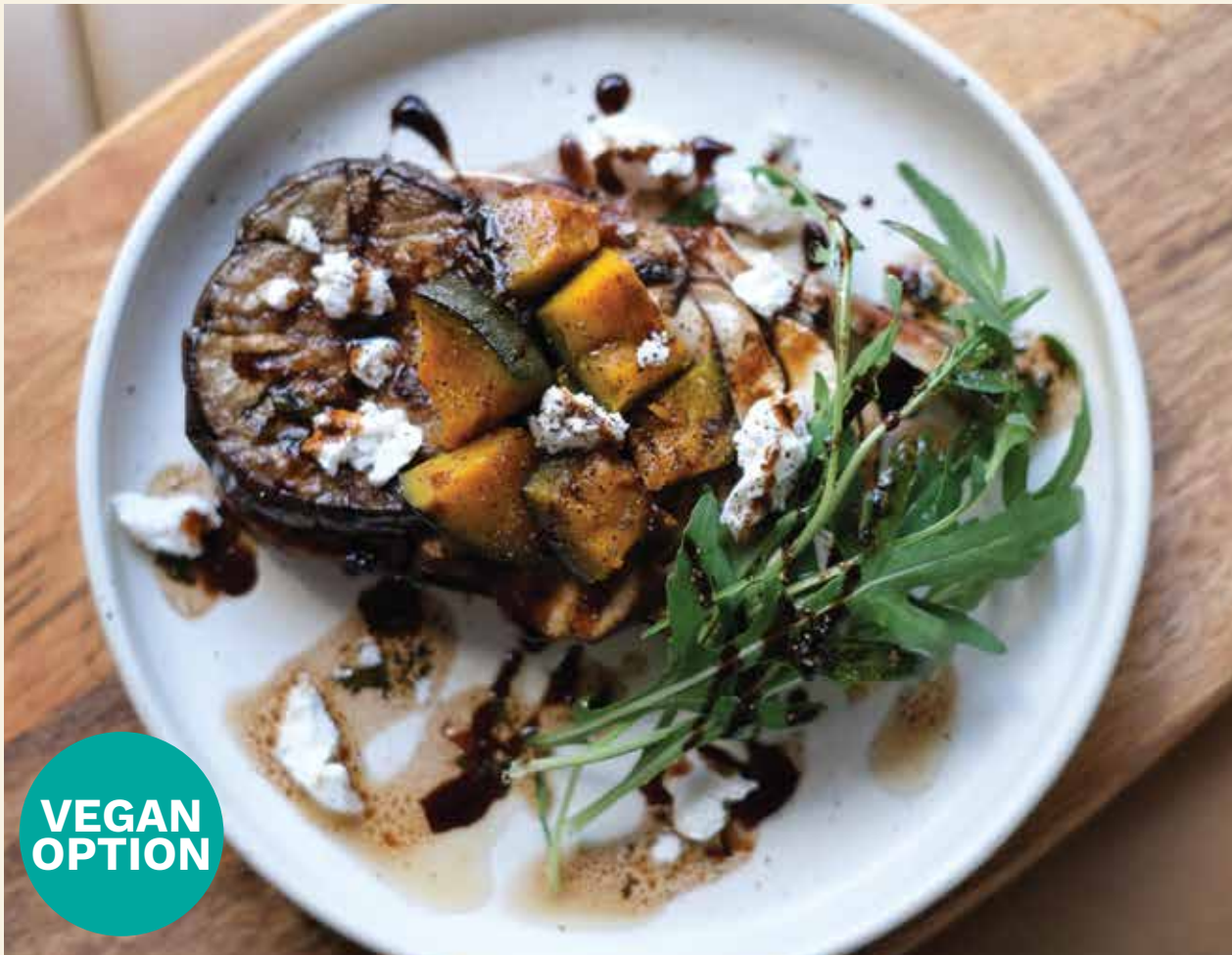
Grilled Vegetable with Homemade Toasted Sourdough 230.-

Warm toasted sourdough cradling tender grilled vegetables, earthy mushrooms, and wild rocket. Each element is gently seasoned and balanced with our balsamic glaze and creamy goat cheese. A grounding, nutrient-rich plate for light nourishment and gentle clarity. *Vegan version available on request—dairy-free and full of plant goodness.