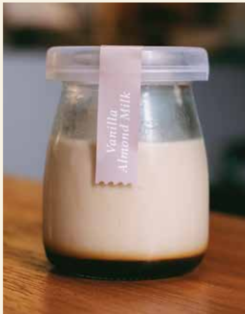
Vegan Caramel Custard Vanilla - Almond Milk